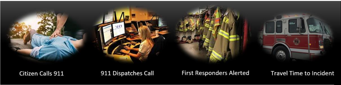
Citizen Calls 911