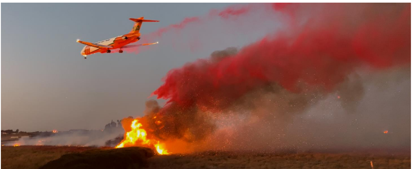
Ranch Marina Fire Incident in River Delta Fire District ~ Destroyed 42 structures and threatened several hundred more with hundreds evacuated. No injuries or deaths