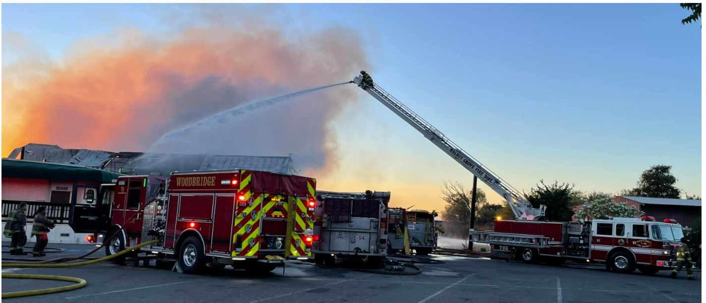
Moore's Riverboat Fire on July 6, 2022. Fire Suppression efforts with our mutual aid partners, Walnut Grove, Woodbridge and Isleton FD's.