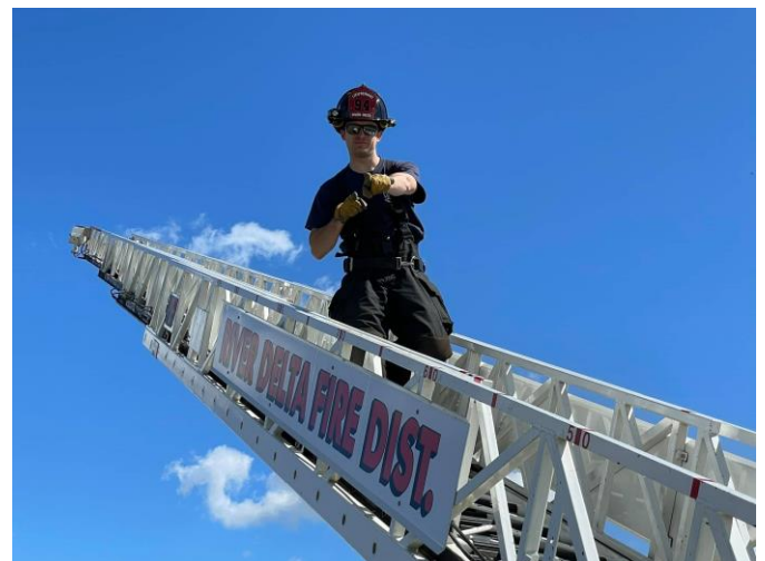
Live fire and Ladder training for 24-Fire Recruits from Montezuma and River Delta Fire Districts.